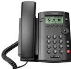
Polycom VVX 101