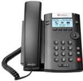
Polycom VVX 201