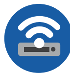
WiFi & Internet