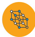
Cabling & Infrastructure