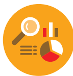
Data & Analytics